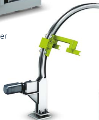
Cam-shaped lifting device