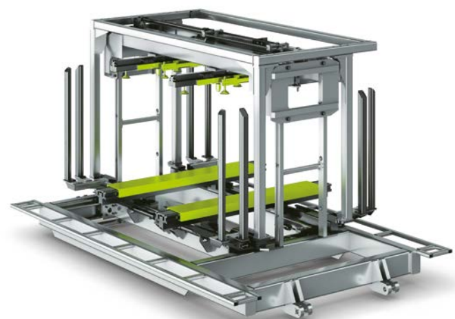
Built-in device for order-picking vehicle